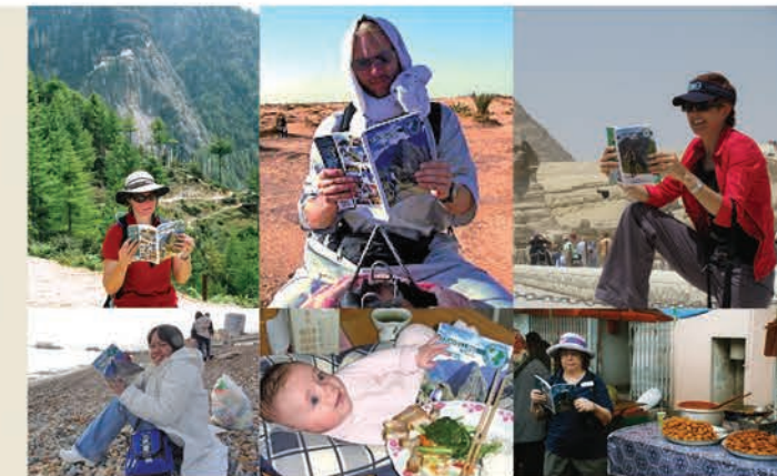
Our travellers regularly consult their book, Travelling Well .

Third , some vaccinations take time to take effect.